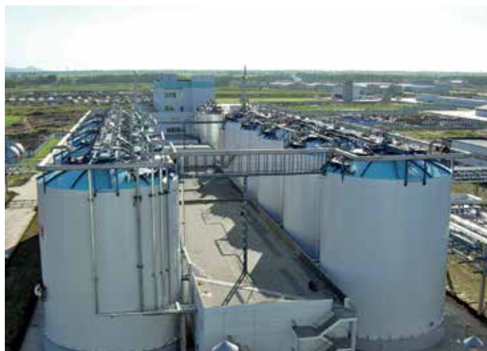
Cascade of 7 main fermenters for the continuous production of 625 m 3 per day of bioethanol

On the other hand, yeast consumption is significantly reduced as the continuous fermentation cascade starts in an aerated and yeast growth promoting prefermenter.