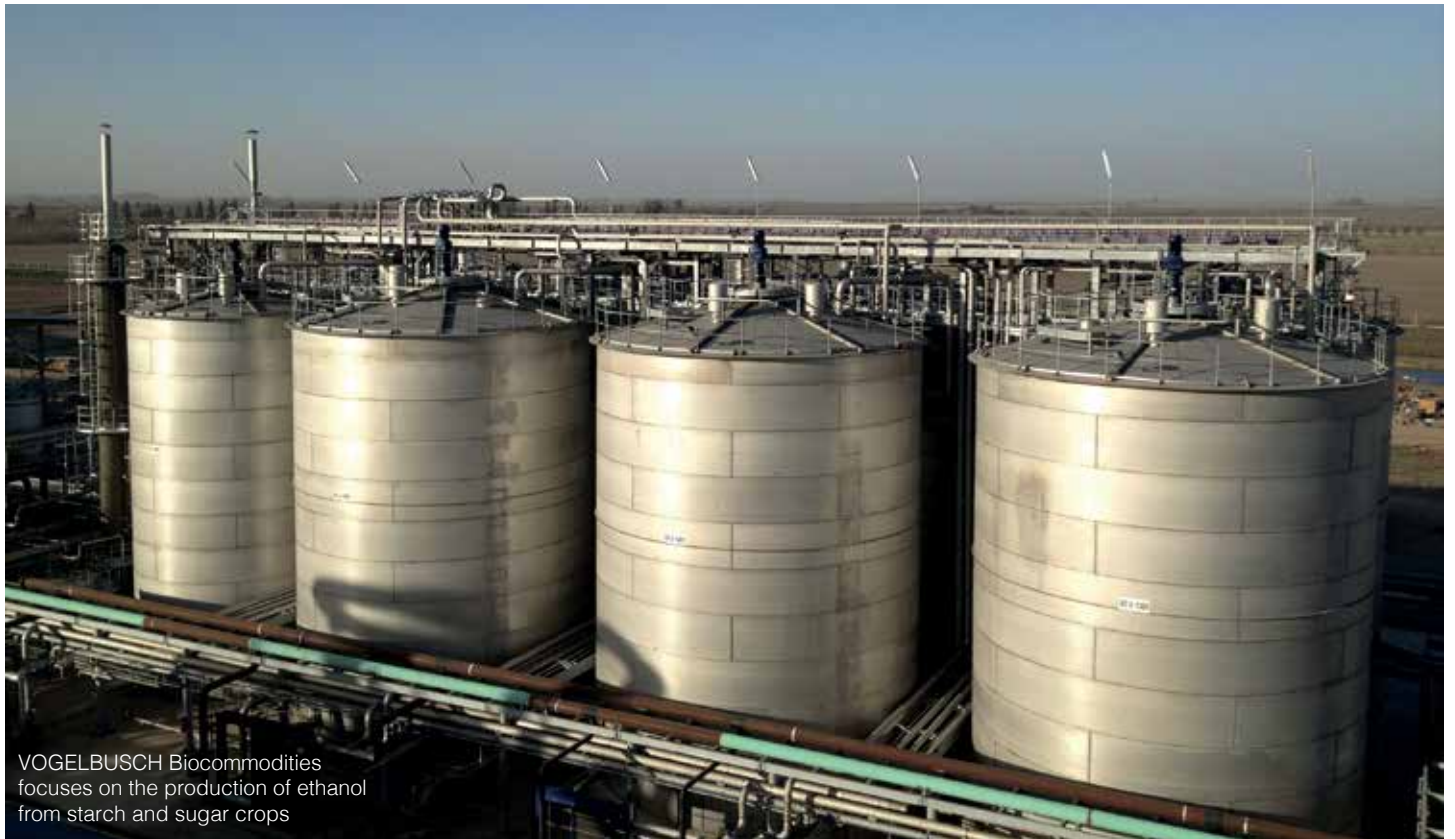
VOGELBUSCH Biocommodities focuses on the production of ethanol from starch and sugar crops

An optimal conversion process in biofuel production depends on the type and quality of the raw material