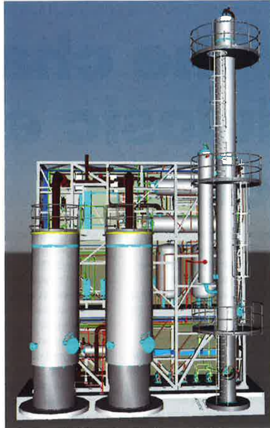
Figure 1: 3D Model of an ethanol dehydration plant with a skid footprint of 10mx5.5m for production of 105,000 liters per day of dehydrated ethanol

just one keystroke. All other process parameters follow automatically: