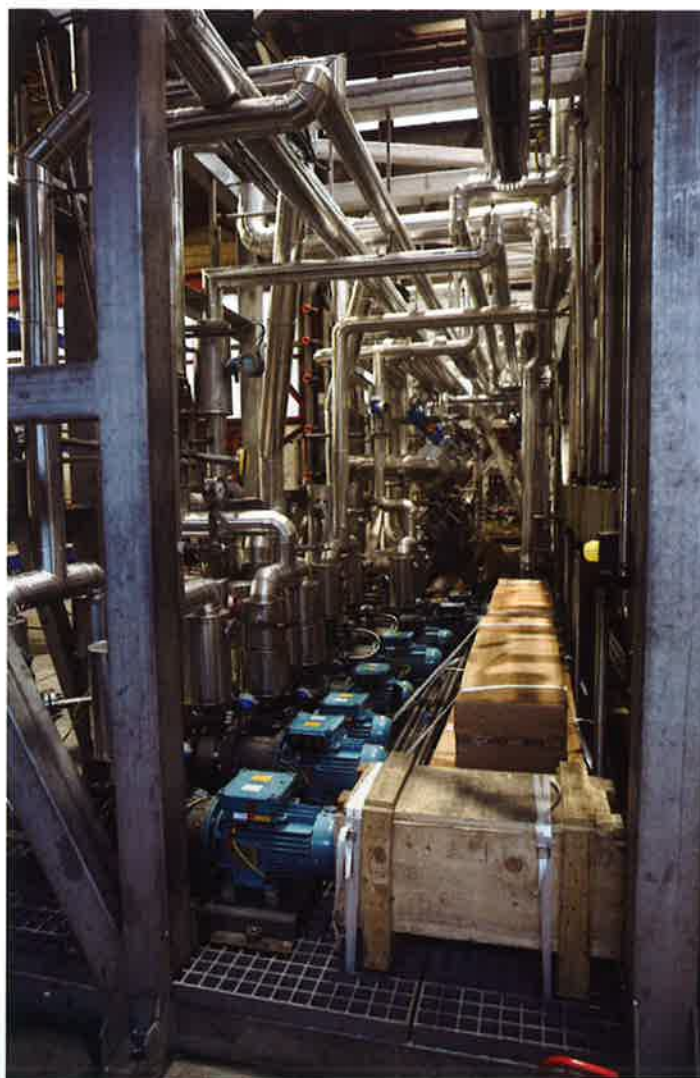
Optimal use of space and accessibility in the pre-assembled skid

To achieve satisfying dehydration results for many years of operation, a few key factors are crucial and have to